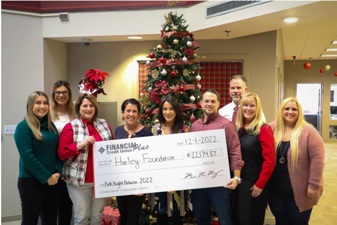
Financial Plus Credit Union raised $22,000.00 through Pink Night campaigns for Hurley Foundation.